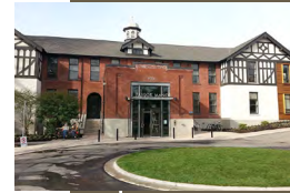
Taylor Manor 56 units March 2015